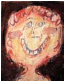
Jean Dubuffet, Smiling Face (La Bouche en Croissant), 1946